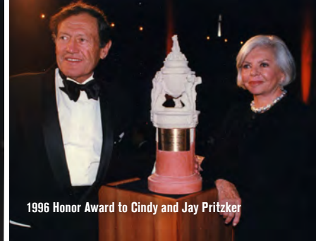
1996 Honor Award to Cindy and Jay Pritzker