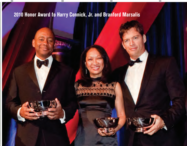
2010 Honor Award to Harry Connick, Jr. and Branford Marsalis