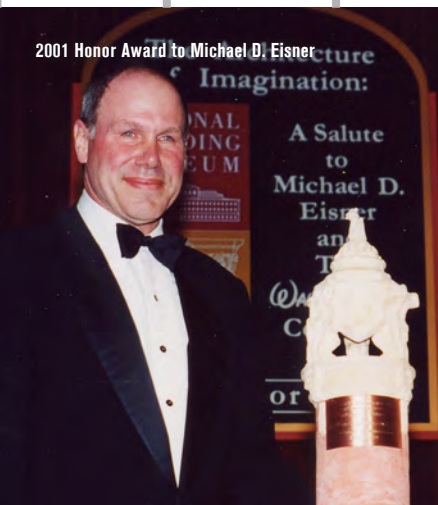
2001 Honor Award to Michael D. Eisner

2014 2015 2016 2017 2018 2019 2021 2022 2023 2024