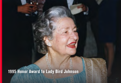
1995 Honor Award to Lady Bird Johnson

Represented on the National Building Museum's Board of Trustees is a diverse range of 40+ executives from architecture and design firms, general contractors, developers, engineering firms, and others, as well as ex officio trustees from cultural organizations such as the Library of Congress, National Trust for Historic Preservation, and the General Services Administration. Their experience helps guide our Mission.