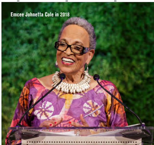
Emcee Johnetta Cole in 2018