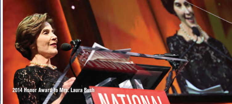
2014 Honor Award to Mrs. Laura Bush

—Mrs. Laura Bush, April 2014, Former First Lady