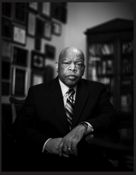
Lewis in 2009.